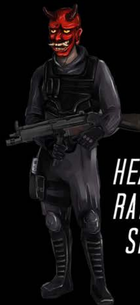
RED HEAD OF THE RATHBONE PRIVATE SECURITY FORCE